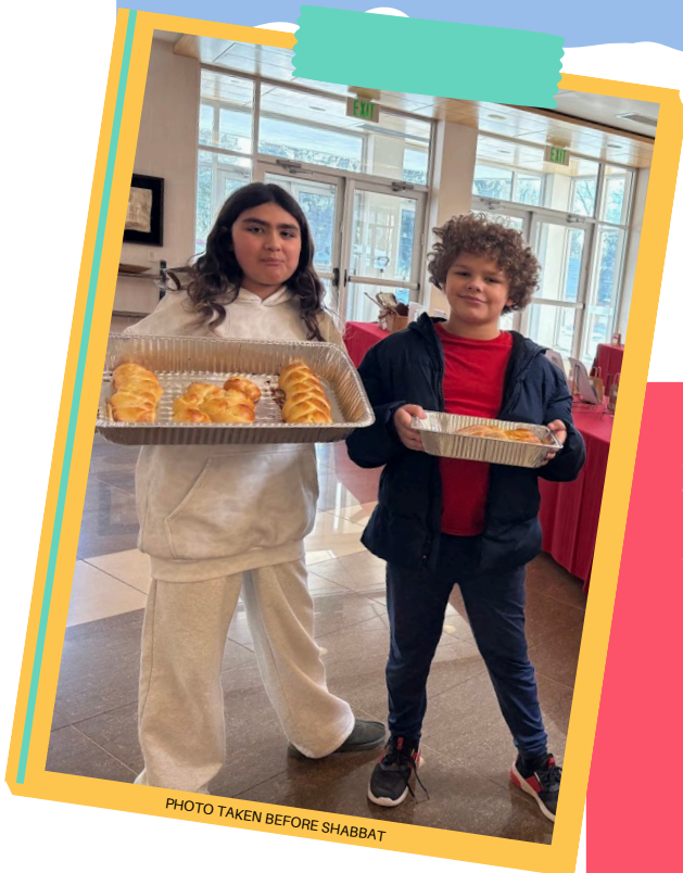
PHOTO TAKEN BEFORE SHABBAT

Our Sunday School joined together with Beth El and Temple Israel for a special collaborative program called "The Ultimate Jewish Mall Adventure." The event transformed familiar stores into creative Jewish-themed experiences, where students "shopped" their way through hands-on activities inspired by places like Target, Starbucks, Home Depot, Pandora, and Apple - each reimagined with Jewish learning and values. Through games, creativity, and interactive stations, the children explored what it means to live Jewishly in everyday life.