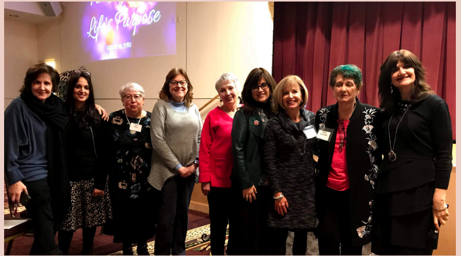
Pictured above: 19th of Kislev Committee