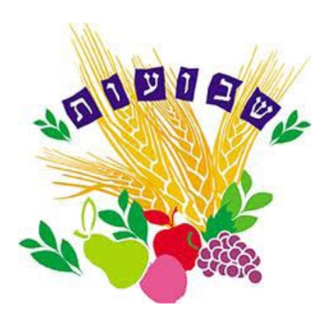
May 19-21, 2018